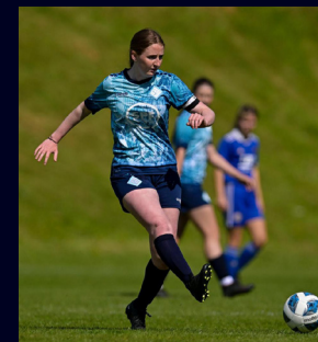
Libby Homes London City Lionesses